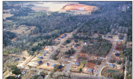
Champion Hills is one of the many subdivisions in rural Mobile County served by Orenco's effluent sewers and treatment systems.

Since 2003, South Alabama Utilities (SAU) in Mobile County, Alabama, has become the subject of nationwide classes, presentations, and tours because of its ambitious and innovative solution for serving nearly 4,000 new customers in 47 new subdivisions in western Mobile County (as well as a number of new schools and commercial properties). How? By installing more than 60 miles